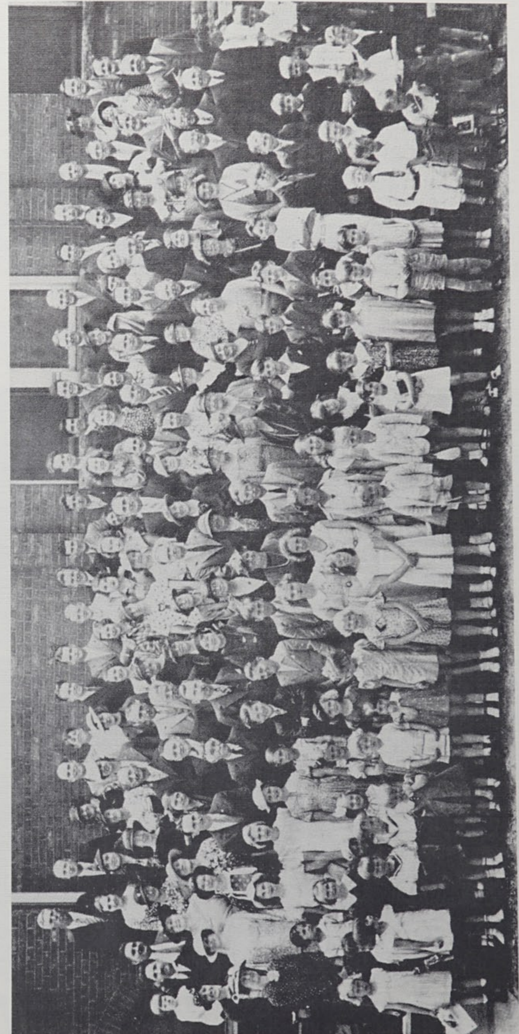
After church May 24, 1936