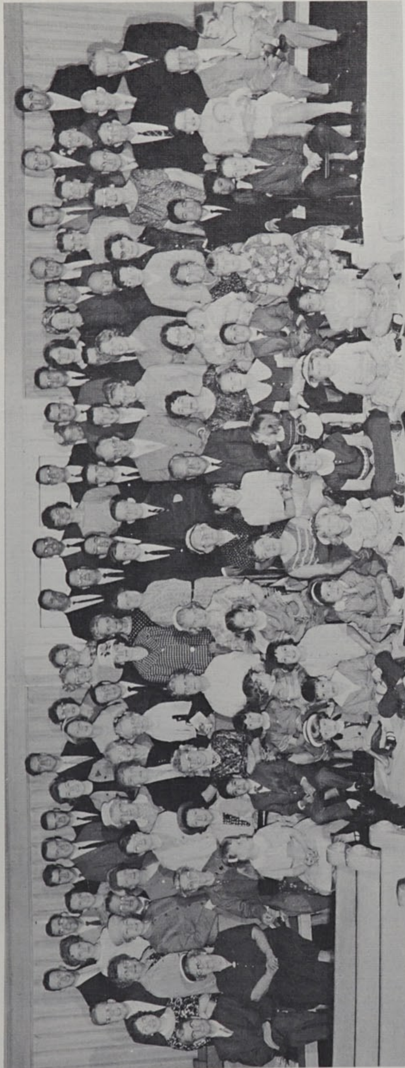
After church April 23, 1961