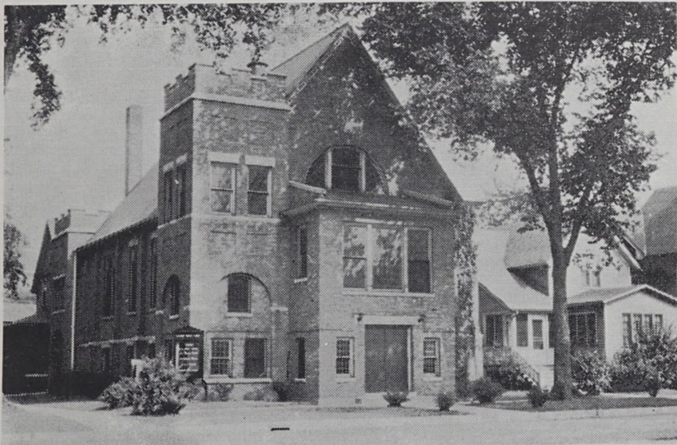
Calvary Baptist Church, 1936

as steps forward. . . . We find all this and much more as we view photographs of what has been. Looking back our lives seem "but as grass," and yet Christ has made them eternal.