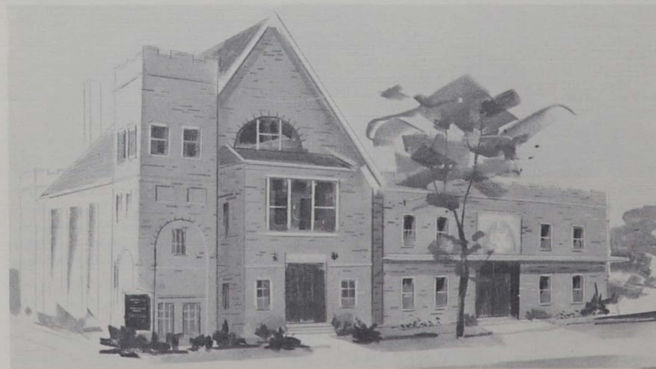
Artist's drawing showing the future education building