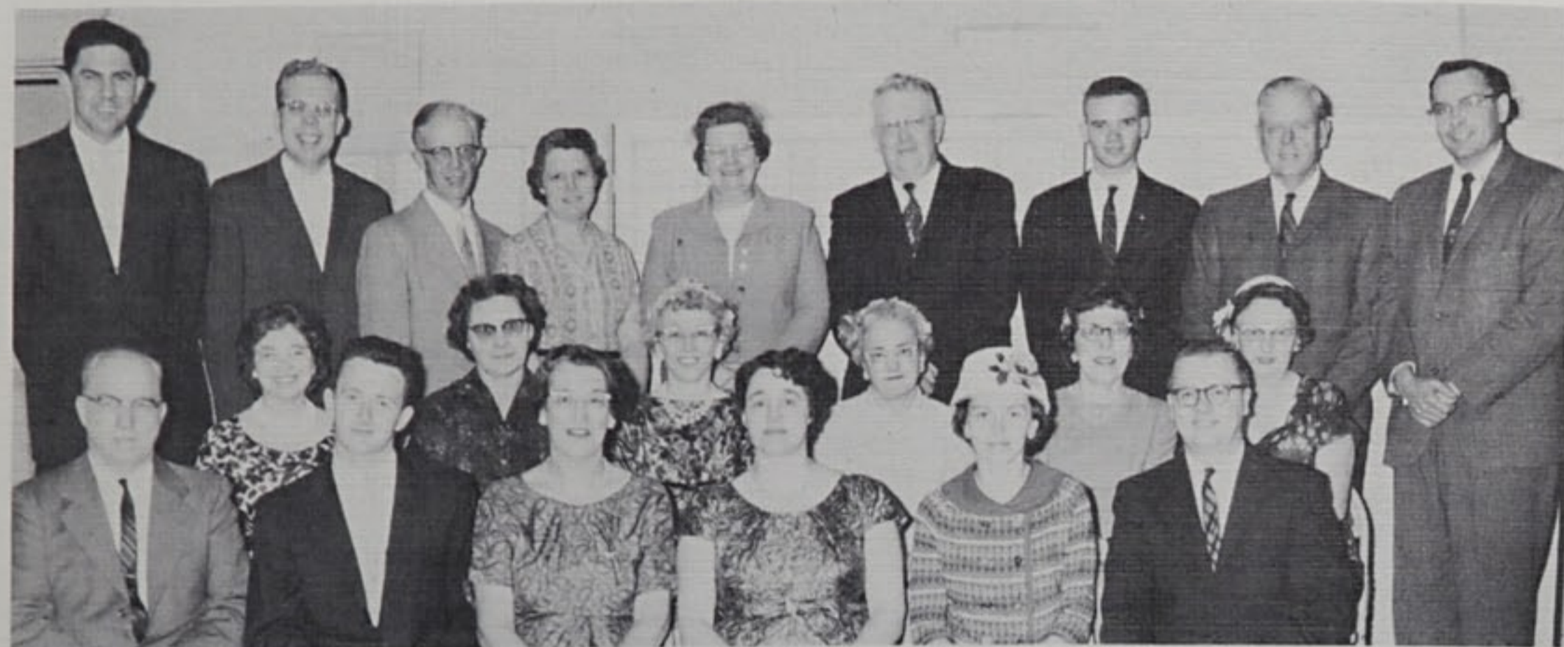
Bible School Teachers, Officers and Board of Christian Education

The Sunday School has always been self-supporting and concerned about missionary work at home and in foreign fields. It has, for many years, been a most fruitful field