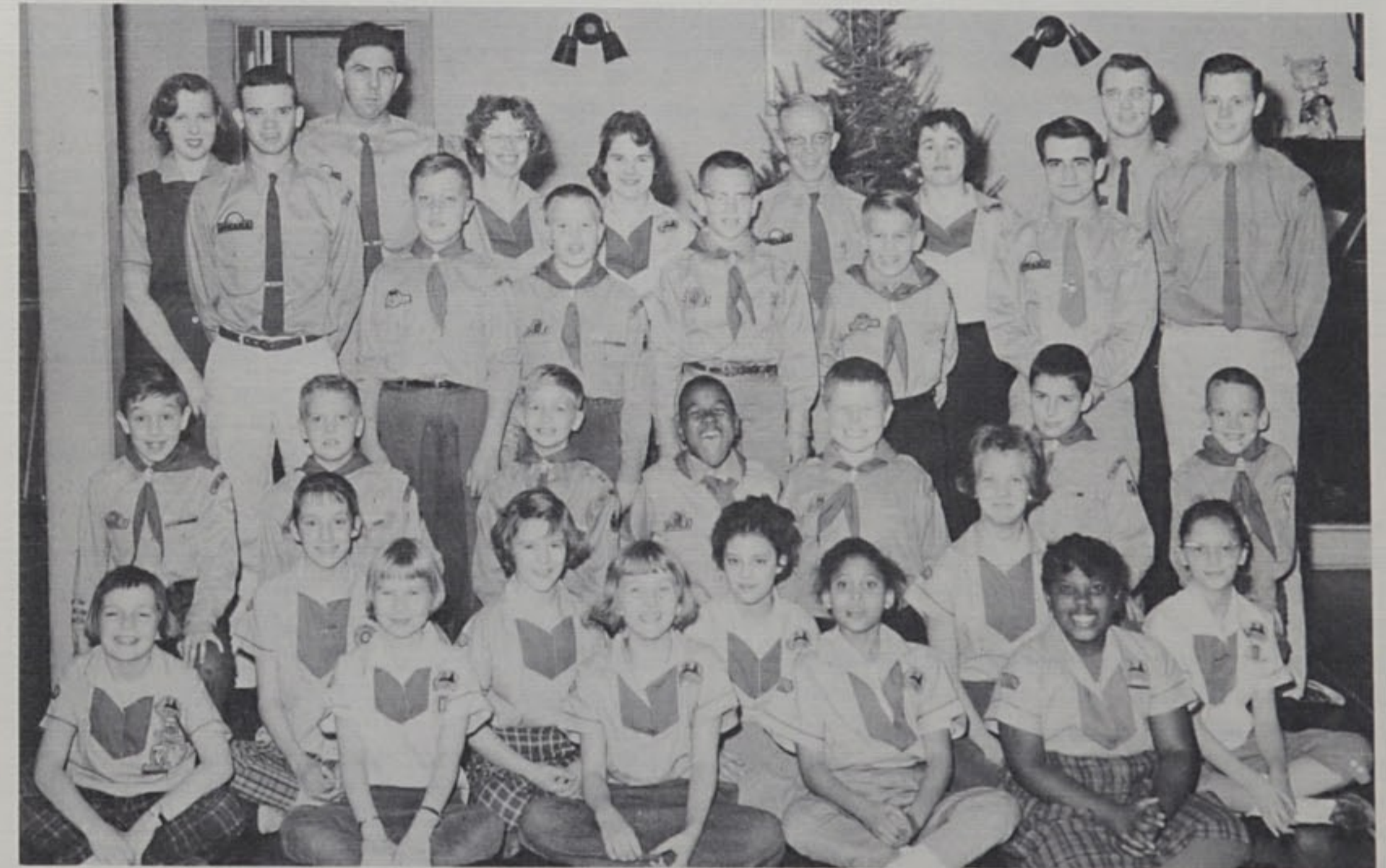
Boys and Girls Awana